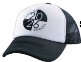
Senior 26 Hat $16