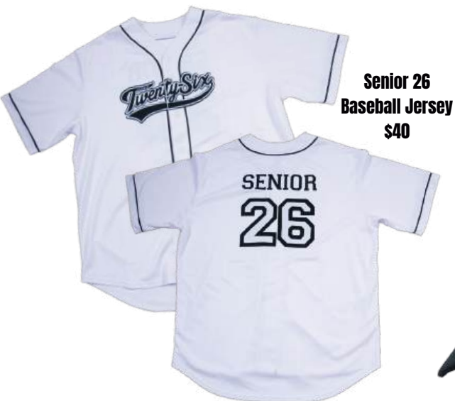
Senior 26 Baseball Jersey $40