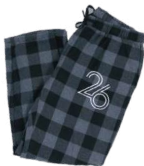
Senior 26 Pajama Pants $30