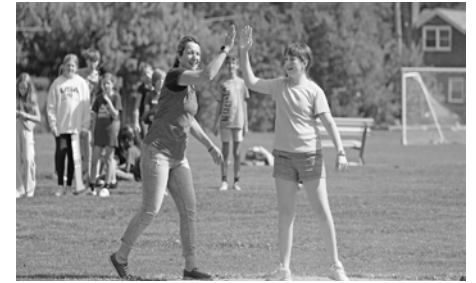
September 2024 Memories: Hoover Middle hosts the annual Gr. 5-7 staff vs. students kickball games.