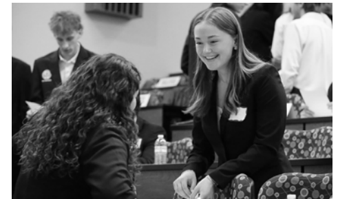
March 2025 Memories: Kenmore East receives "Best Overall Delegation" at Regional Model UN competition.