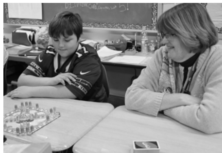
December 2024 Memories: Left photo, students/staff enjoy activities at Franklin Middle's Fun Fest.