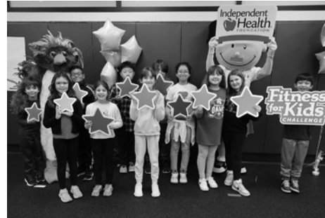
November 2024 Memories: Hoover Elementary unveils its new Independent Health FitLab.