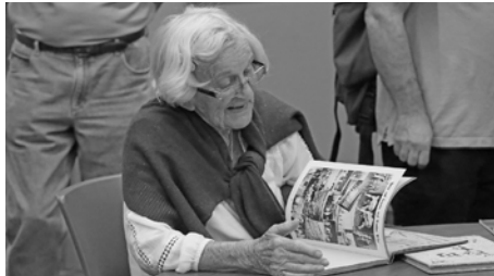
September 2024 Memories: Staff, students, and hundreds of community members celebrated the 100th anniversary of the Kenmore Jr/Sr High School building.