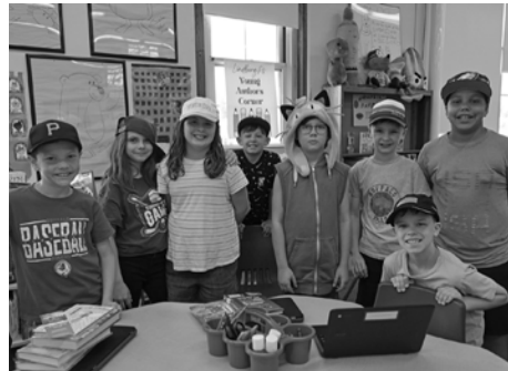
May 2025 Memories: Lindbergh Elementary raises money for Cystic Fibrosis treatment/research by wearing hats to school.