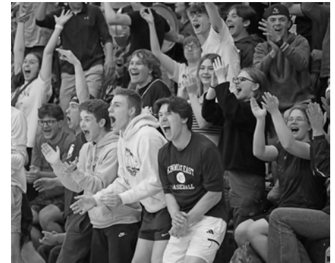
May 2025 Memories: Students cheer on both teams at the annual Kenmore East vs. West unified basketball game.