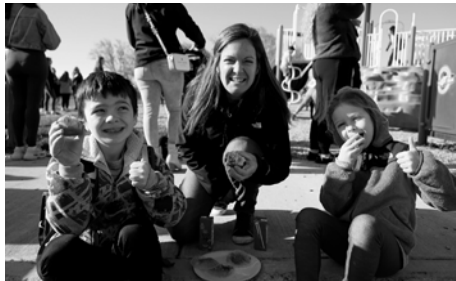
May 2025 Memories: Holmes Elementary PTA hosts Muffins with Mom in honor of Mother's Day.