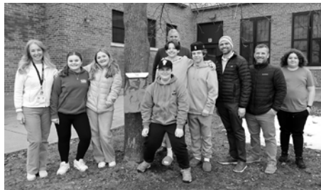
March 2025 Memories: Franklin Middle students enter maple tree sap contest.