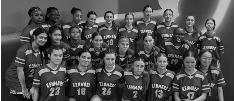
April 2025 Memories: The Kenmore Girls Flag Football Team kicked off their inaugural season with a win over Williamsville North. The DevilDogs went on to win the Division I Class A Championship with a 7-0 division record and finished the season with an overall 14-3 record.