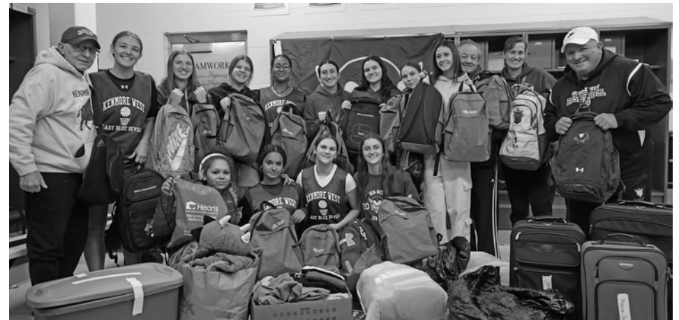
December 2024 Memories: Kenmore West varsity girls basketball players collect clothes and toiletries to donate to the Buffalo Women's Shelter.