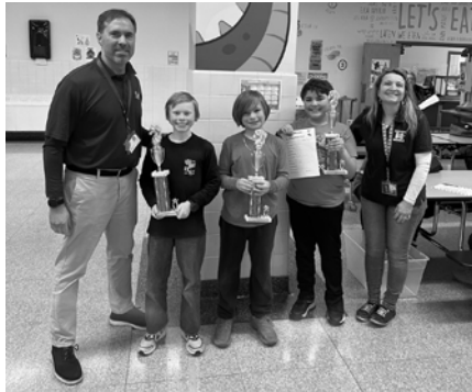
April 2025 Memories: Franklin Middle and Hoover Middle students compete in Chess Tournament.