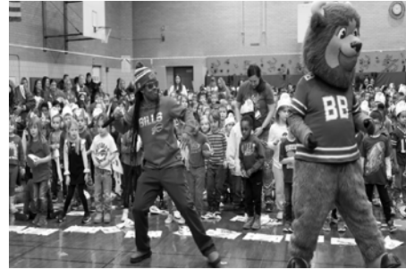
January 2025 Memories: Buffalo Bills and Wegmans staff hold pep rally at Hoover Elementary.