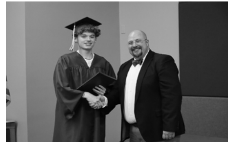
June 2025 Memories: Top left, Kenmore East graduation. Top right, Kenmore West graduation. Bottom left, Big Picture graduation. Bottom right, Crossroads Academy graduation.