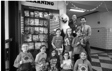
February 2025 Memories: Edison Elementary unveils its new Book Vending Machine.