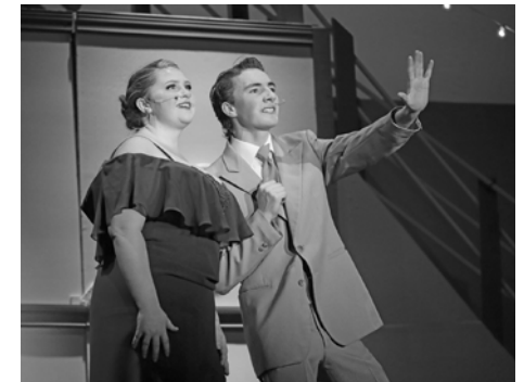
February 2025 Memories: Kenmore West presents "Anything Goes." The musical was nominated for five Shea's Wonder Awards, later winning for Outstanding Student-Led Orchestral Performance.