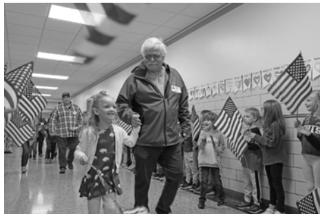
November 2024 Memories: Edison Elementary students and veteran guests parade through the school hallways in honor of Veterans Day.