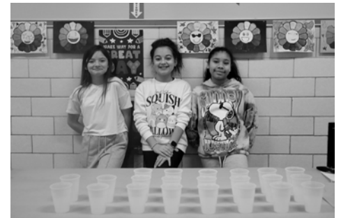
January 2025 Memories: Schools hold fundraisers for the 38th annual Jerry Starr Ken-Ton Schools' SleepOut. Edison Elementary (top photo) sold Links4Love. Franklin Elementary (bottom photo) sold lemonade and Links4Love.