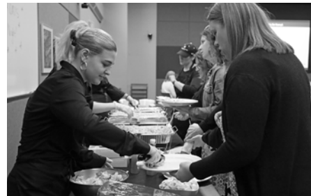
May 2025 Memories: Crossroads Academy students host special homemade luncheon for staff and district administrators.