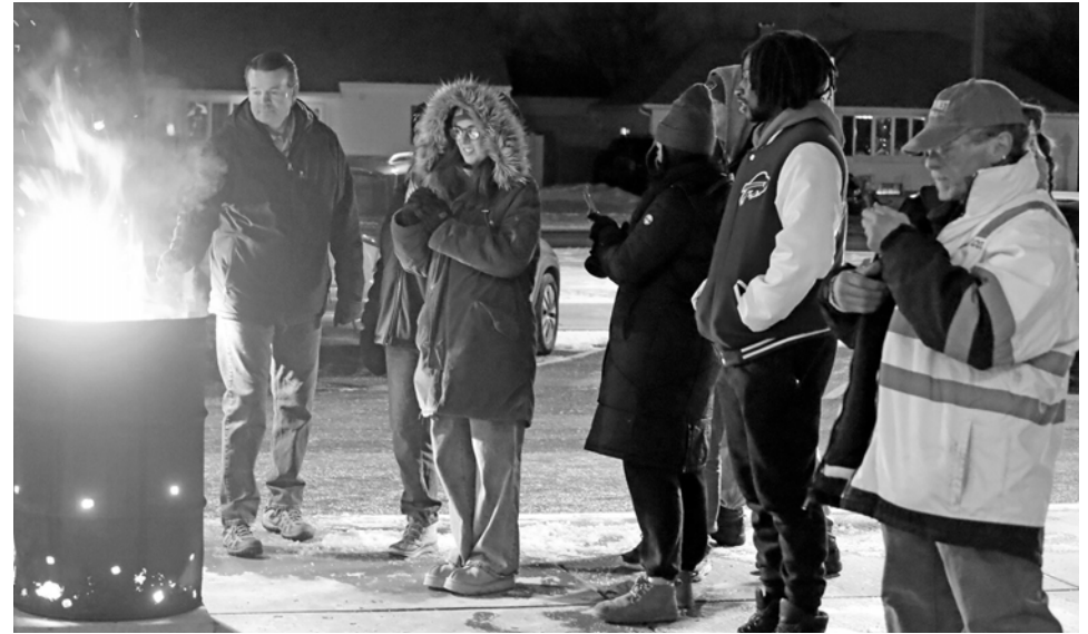
February 2025 Memories: Staff, students, and community members attend the 38th annual Jerry Starr Ken-Ton Schools' SleepOut held at Kenmore East High School.