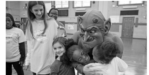
October 2024 Memories: Kenmore West soccer players and the Blue Devil mascot visit Lindbergh Elementary physical education classes to teach students about the game of soccer.