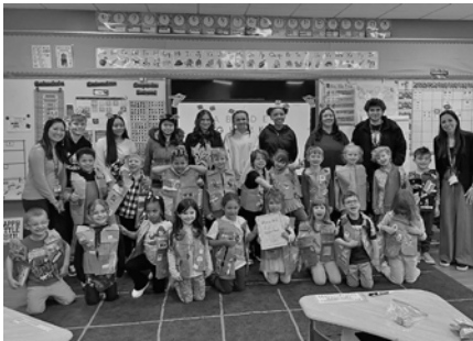
April 2025 Memories: Kenmore West art students team up with Edison Elementary kindergarten class for alphabet project.