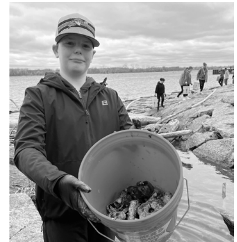
April 2025 Memories: Students, staff, and their families help clean the Ken-Ton School District's adopted section of the Niagara River Greenway Shoreline Trail.