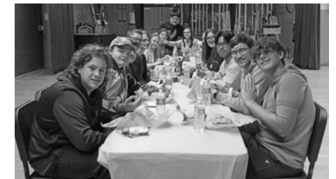
November 2024 Memories: Kenmore East music students celebrate annual "Bandsgiving".