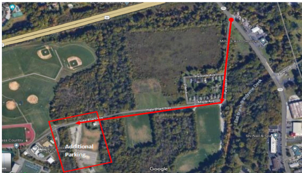
FIGURE 1: The DYW parking lot is only accessible from Wallace Avenue (Rte 282) and not directly by car from campus.