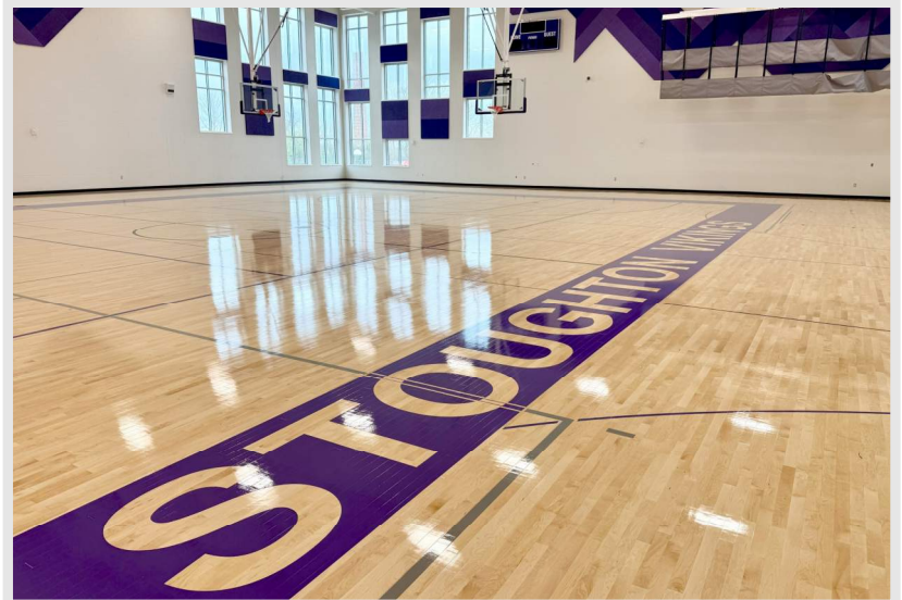
Bottom Right: a photo highlighting the new River Bluff gym as part of the addition, check out all that natural light!