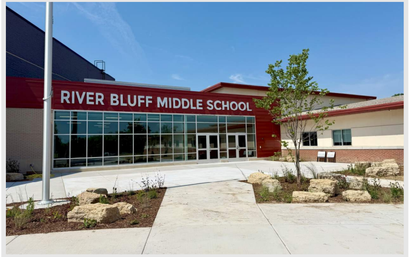
Top Right: a view of the new entrance to the River Bluff Middle School featuring the recently installed landscaping

We are excited to share that the River Bluff Middle School addition passed all final inspections earlier this week and received a certificate of occupancy from the City of Stoughton! This 22,000 square-foot addition to the existing school consists of a beautiful gym with seating capacity to fit the school's entire student body, plus staff. The addition also includes two large multipurpose rooms for fitness training and athletics, multiple restrooms, and lots of storage for gym equipment. This project also featured a complete transformation of the River Bluff Campus by removing two existing buildings to create space for the new parking lot and student drop-off/pick-up lanes. We are looking forward to welcoming students and staff into their new space this fall!