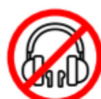
Headphones and Earbuds

Devices must be kept at home or stored away (turned off in backpacks). Only district-provided devices are approved for use during class time. Exceptions will be made for approved medical needs, a documented need based on a directive from a qualified physician, or special education needs (as outlined in the student’s IEP or 504 plan). Students who do not adhere to this policy will receive the following consequences: