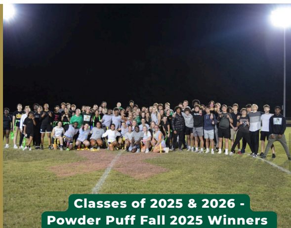
Classes of 2025 & 2026 - Powder Puff Fall 2025 Winners