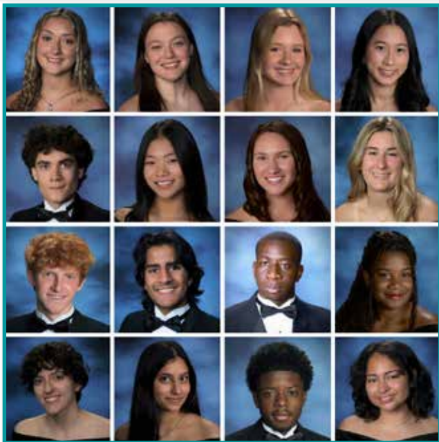
Pictured are the Class of 2025 valedictorians and salutatorians. Read more about these class leaders on Page 36.