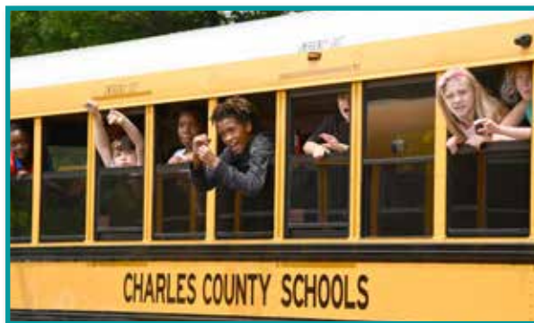
Dr. James Craik Elementary School students wave to staff members on the last day of school.

Prekindergarten students receive report cards two times a year. Students in kindergarten through second grade receive report cards four times a year. A parent conference for students is scheduled for November.