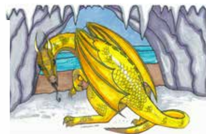
Medieval Art Adventure