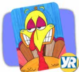
Critters & Color Fall Art

#6956-B Tu Sept 16-Oct 7 4 sessions $75 3:55-4:55 pm RLE: Field 6