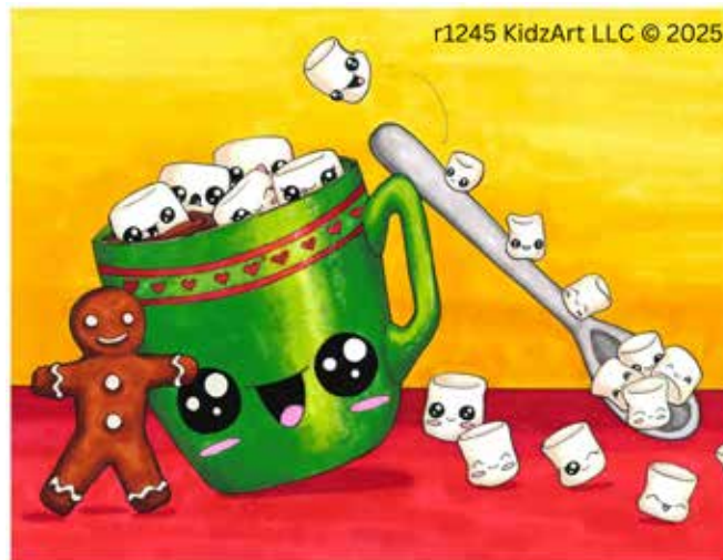
Frosty Fun Art

#6956-E F Sept 19-Oct 10 4 sessions $75 3:55-4:55 pm CVE: Field 4