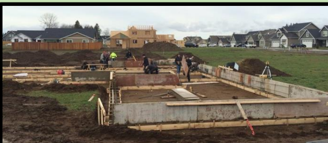
The Keystone Project