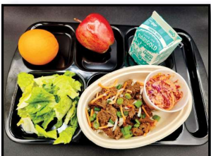
Selah Nutrition provides delicious meal service.