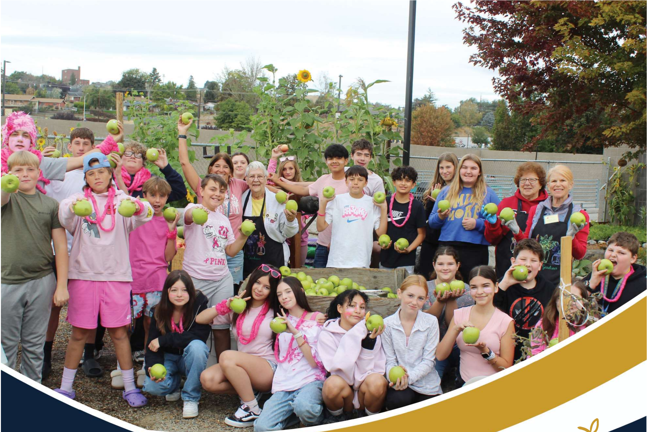
Diverse learning opportunities are important for student growth. Here, Selah Middle School students participate in a cider making activity at the school's greenhouse.