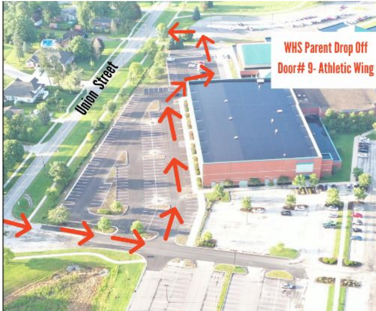
East Side of the Building