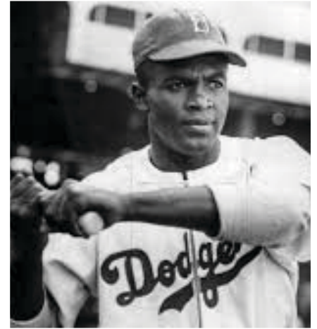
Major League Baseball Player Jackie Robinson

“ Why did the skeleton break up with his girlfriend? Because she didn't have the guts to love him ”