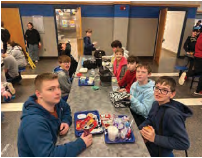
7th Grade Boys enjoying their lunch!

GABE STEWART WHITE HOUSE (Big Blue News)-