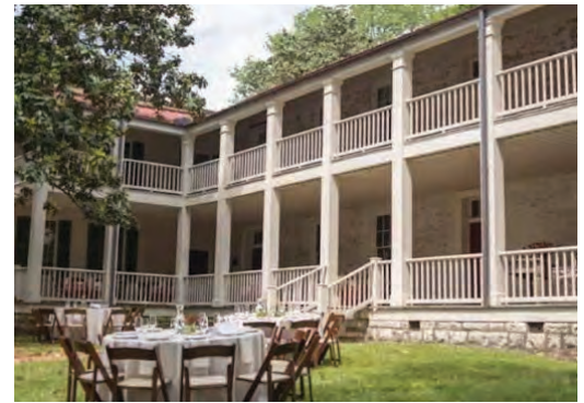
Travelers Rest Nashville