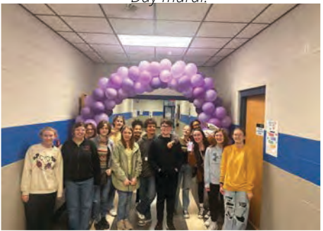
Big Blue News Staff poses under the P.S. I Love You Day balloon arch.

Of course, these are just suggestions--do whatever makes you happy! Valentine's Day is about love in all forms, including self-love.