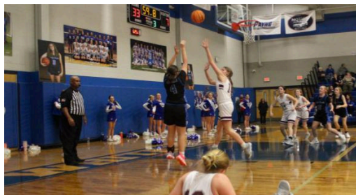
Girls basketball team defense guarding a shot