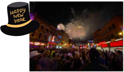
The city of Nashville ends the night with fireworks