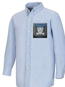
Item No. AG5766:

Agregue $ 1 por cada tamaño más grande que XL