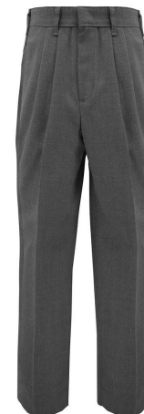
Item No. AG7880R

Blazer azul marino (abrigo) $90.00 (Youth 4-20, Men 36R-46R) $95.00 (Husky, Hombres-58R)