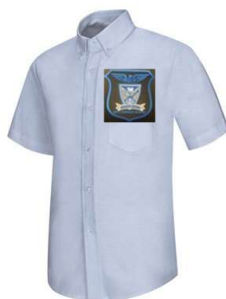
Item No. AG56702

Oxford Button Down Colores disponibles: Azul claro, Blanco Manga corta con parche: $23.00 Manga larga con parche: $26.00