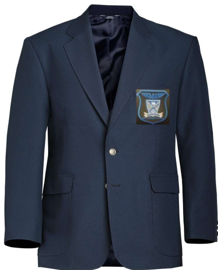
Item No. AG3000

Blazer azul marino (abrigo) $90.00 (Youth 4-20, Men 36R-46R) $95.00 (Husky, Hombres-58R)