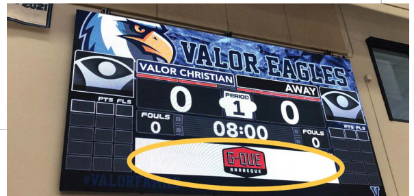
PANORAMA GYM SCOREBOARD