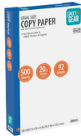
8 x 11 white printer paper