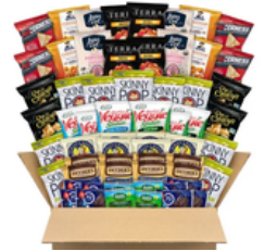
Snack to share