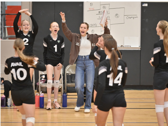
Junior Varsity Volleyball was the EMAC Conference Tournament Champions.

An all-conference award in high school athletics is a recognition given to individual student-athletes who are deemed among the best performers in their respective sport within a specific conference. Conference coaches vote on this award.