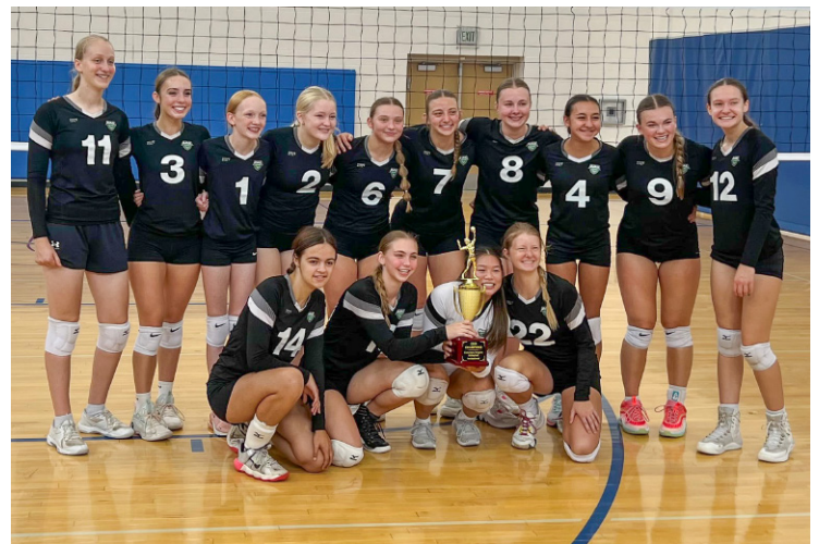
Varsity Volleyball took the Championship at the Columbia Heights Conference.