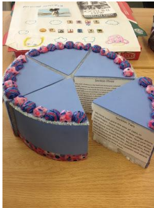
Cake Book Report