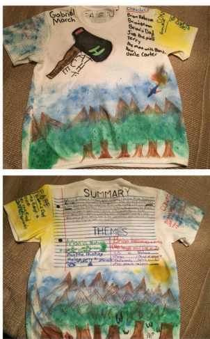
T-Shirt Book Report