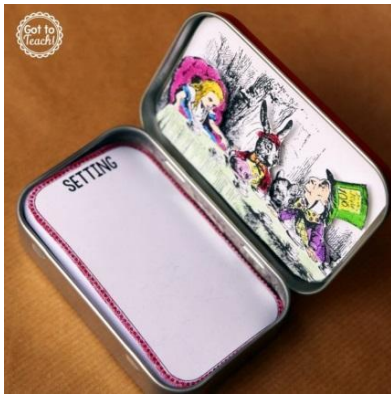
Mint Tin Book Report