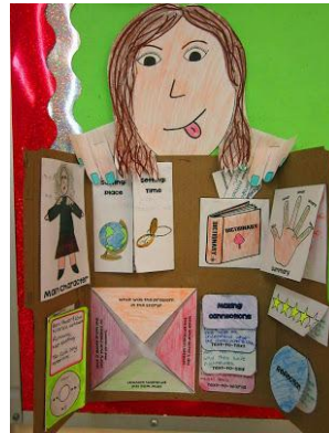
Peekaboo Book Report