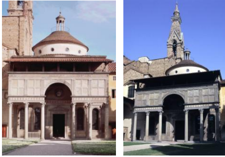
21-17 FILIPPO BRUNELLESCHI, facade of the Pazzi Chapel, Santa Croce, Florence, Italy, begun ca. 1440.