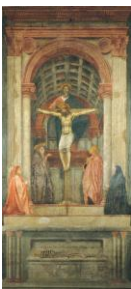
HOLY TRINITY: MASACCIO