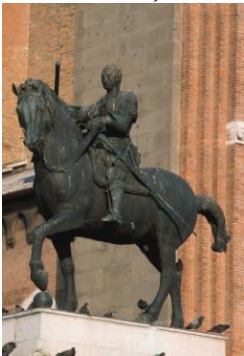
21-29 DONATELLO, Gattamelata (equestrian statue of Erasmo da Narni), Piazza del Santo, Padua, Italy, ca. 1445-1450. Bronze, approx. 11' x 13'.

In fifteenth-century Italy monuments and portraits praising the worldly accomplishments of individuals became increasingly popular. One showed the condottiere , or military leader, on horseback.