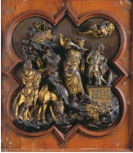
1-01 FILIPPO BRUNELLESCHI, Sacrifice of Isaac, competition panel for east doors, baptistery of Florence Cathedral, Florence, Italy, 1401-1402. Gilded bronze relief, 1' 9" x 1' 5". Museo Nazionale del Bargello, Florence.

Architecture is central to understanding the birth of the Renaissance and it was in Florence that the first great buildings of the Renaissance were constructed. One man above all others was the originator of the new style in architecture: Filippo Brunelleschi (1377-1446). It was Brunelleschi who traveled from Florence to Rome to study the remains of Roman architecture. He measured them, studied the construction techniques and probed their proportions and the way in which the ancient Roman architects learned to mold space through the innovation of the arch and vault. Brunelleschi was the most visible artist in the city, with the designs of the Medici Church of San Lorenzo, the Pazzi Chapel at Santa Croce and the huge dome of the Cathedral of Florence simultaneously working on other projects.