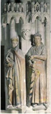
18-49 Ekkehard and Uta

The growth of portraiture reflected the Renaissance concern with individualism and is another reflection of humanism and the need to leave a monument, which reflects the accomplishments of the individual. Earlier portraits had most often been done in connection with devotional foundations, and they were often imaginary representations, for example the thirteenth-century representations of Ekkehard and Uta in Naumburg Cathedral represented earlier benefactors of the cathedral (18-49).