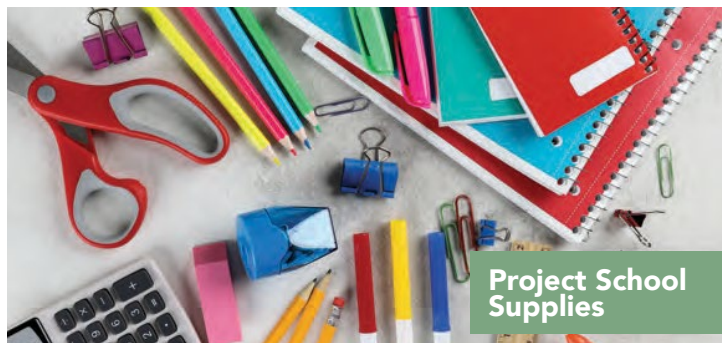
Project School Supplies

Project School Supplies provides economically-disadvantaged students at both Title I and non-Title I campuses the supplies they need to begin the school year. Our donors make it possible for all SBISD students to begin the year with the tools critical for success in the classroom.