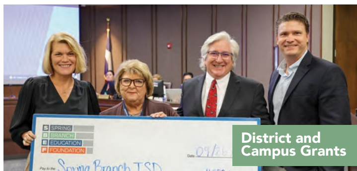
District and Campus Grants

Project School Supplies provides economically-disadvantaged students at both Title I and non-Title I campuses the supplies they need to begin the school year. Our donors make it possible for all SBISD students to begin the year with the tools critical for success in the classroom.