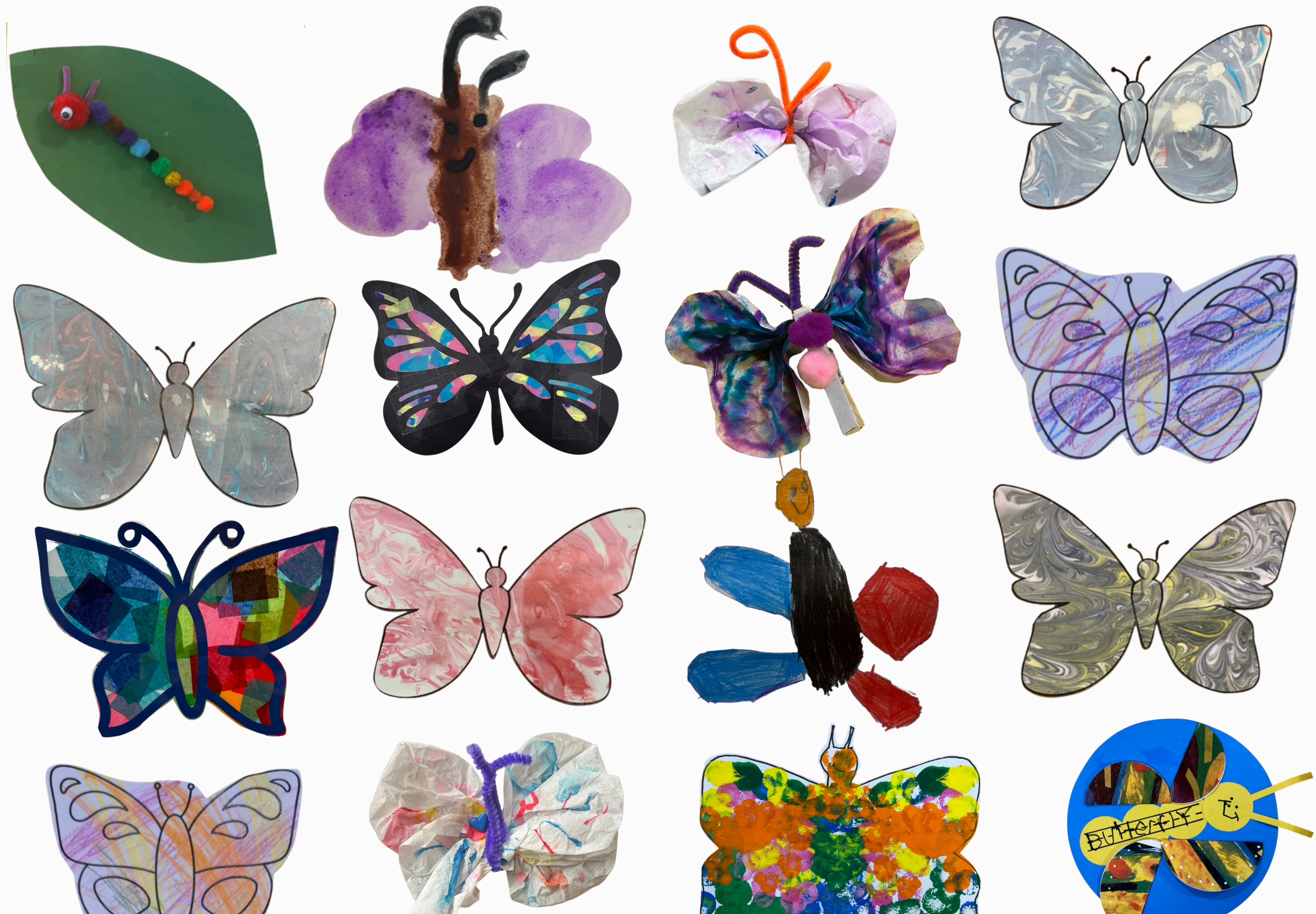
OAKVIEW PRIMARY SCHOOL, REGIONAL CENTER FOR EARLY LEARNING, OAKVIEW MIDDLE/HIGH SCHOOL & SIX TO SIX