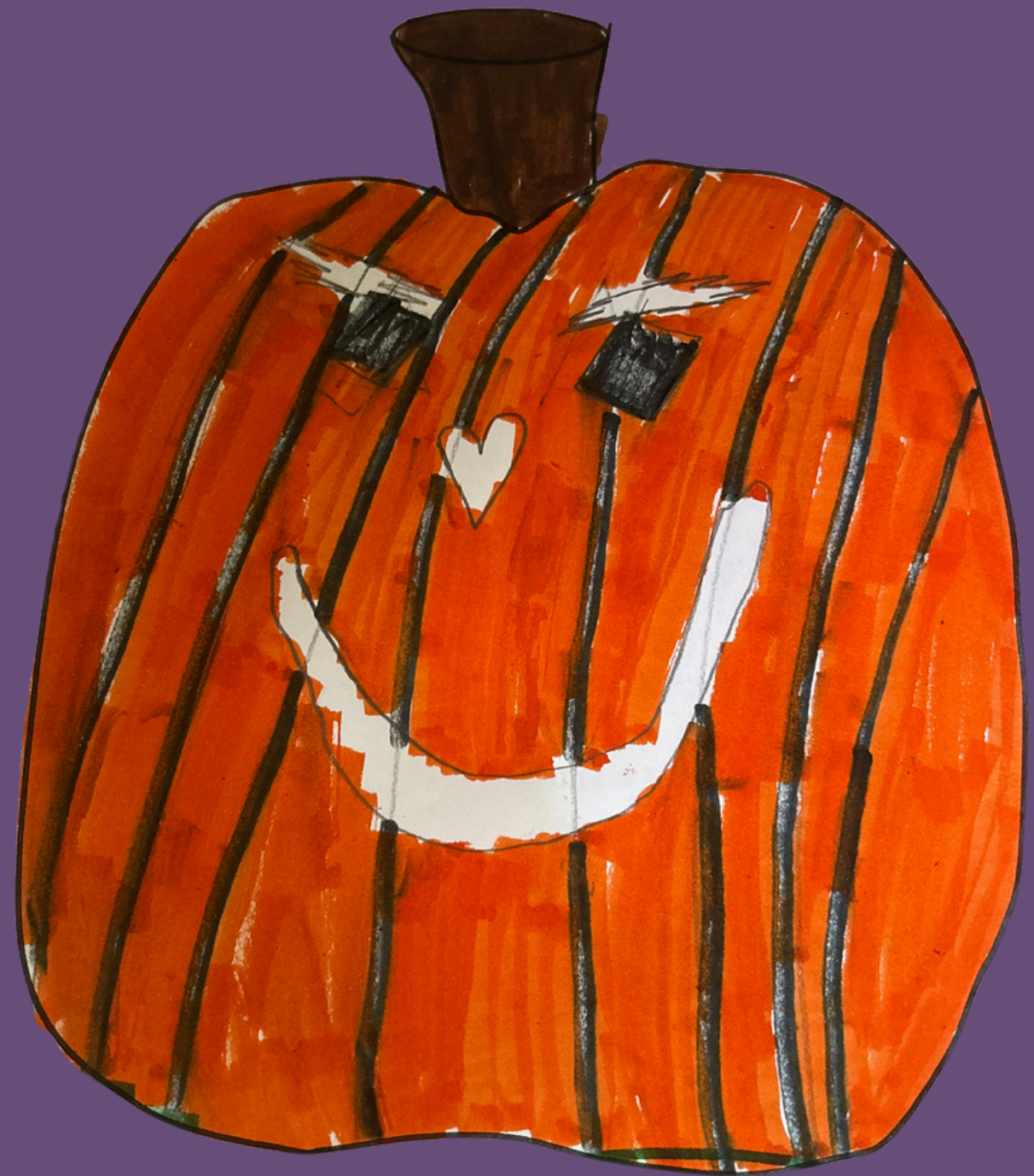
SIX TO SIX GRADE 2