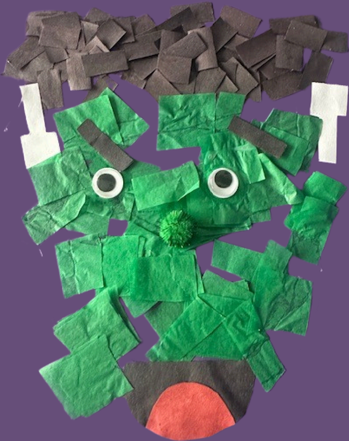
OAKVIEW MIDDLE/HIGH SCHOOL GRADE 8