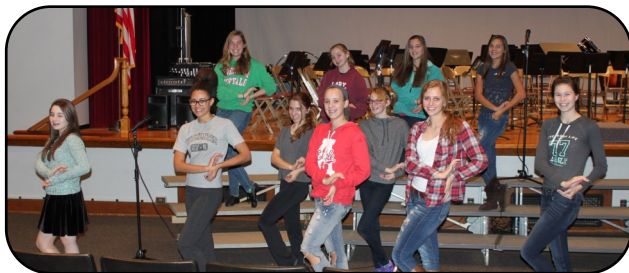
Cast members from "Mary Poppins" provide smiles with hard work as they prepare for their March performance.