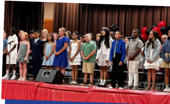
Barton Elementary School