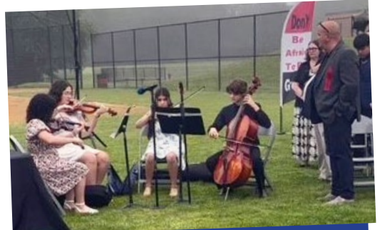
Oregon Middle School