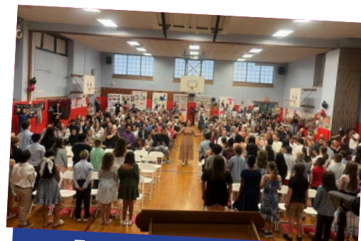
Tremont Elementary School