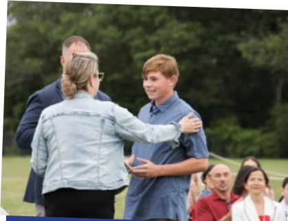
Saxton Middle School