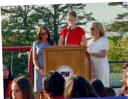
Eagle Elementary School