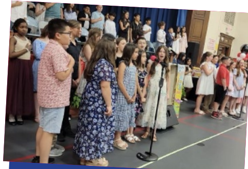
Medford Elementary School