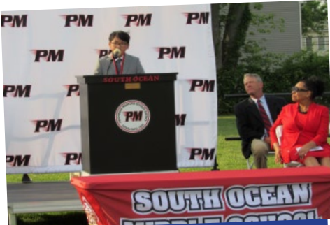
South Ocean Middle School

The Patchogue-Medford School District proudly celebrated the achievements of our elementary and middle school students during this year's moving-up ceremonies. These joyful events marked an important milestone as students prepare to take their next big steps—whether entering middle school or beginning their high school journey. Families, board trustees, administrators, teachers, and staff came together to honor the hard work, growth, and accomplishments of each student. Enjoy this collection of photos capturing the pride and excitement of these memorable days.