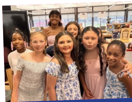
Bay Elementary School