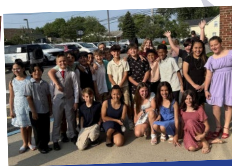
River Elementary School