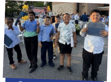
Caanan Elementary School