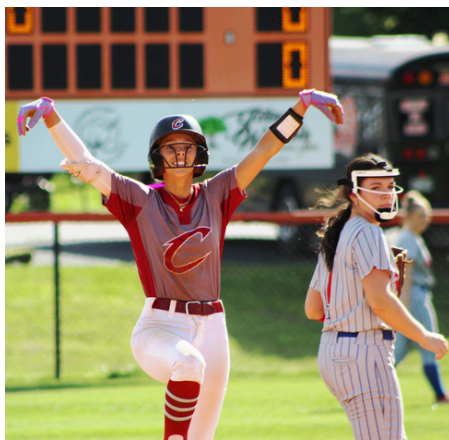
Above:...and then celebrates with the Lady Cavs' newest pose as the scoreboard reflects that it's been a tough day for the hitters thus far.