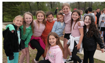
Emergency alerts can be activated inside or outside the school building, providing added protection at RCS playgrounds, stadiums and school campuses.