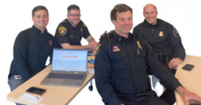
If a lockdown is activated, administrators, first responders and technology teams are all immediately informed and ready to respond.