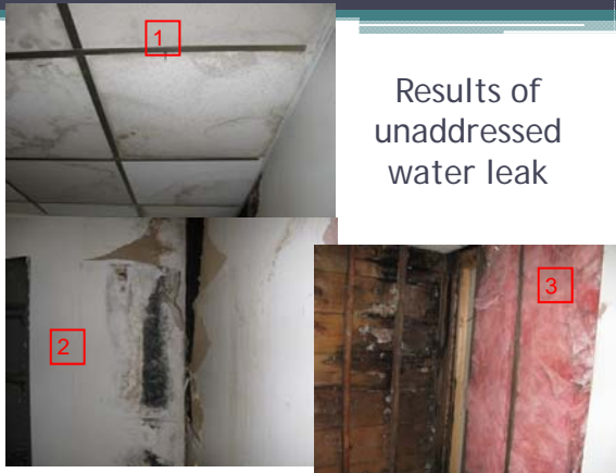
Results of unaddressed water leak