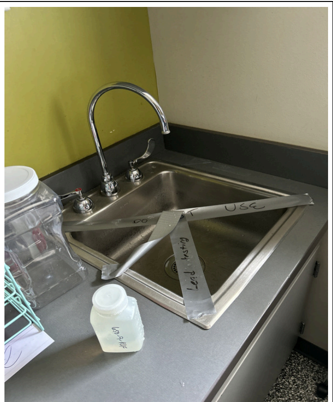
6/27/2024 - 650-9 - Classroom 107 - 001864- Room 107-Right