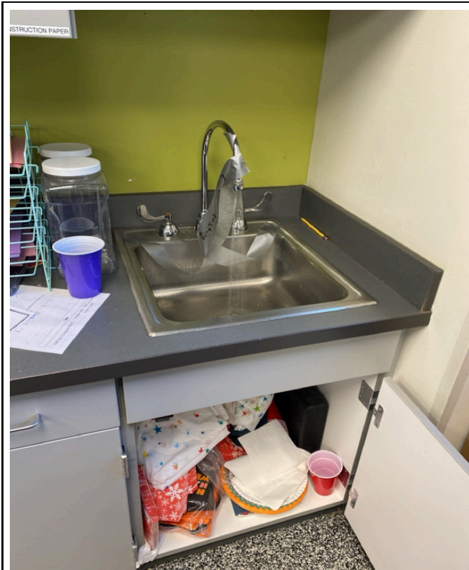
4/30/2024 - 650-9 - Epic Elementary - 001864- Room 107-Right