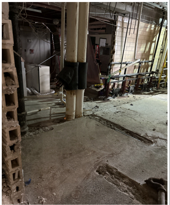
7/3/2024 - 701-91 - Ridgeview Elementary - 001755-By 110-Girls-Left-Source Removed