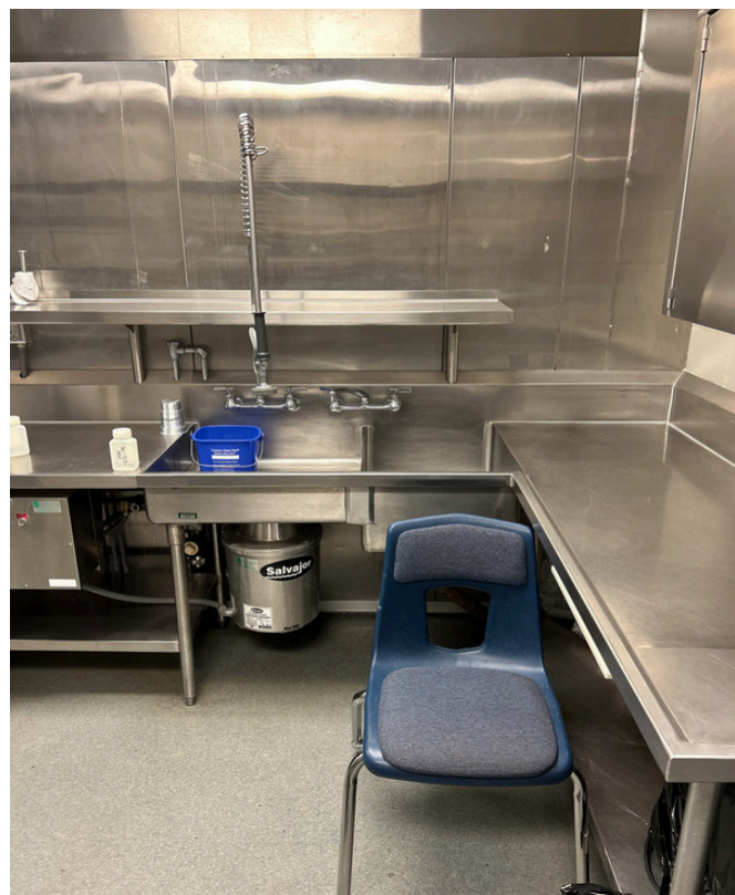
7/3/2024 - 701-122 - Ridgeview Elementary - 001743-Kitchen-Three Bay Sink