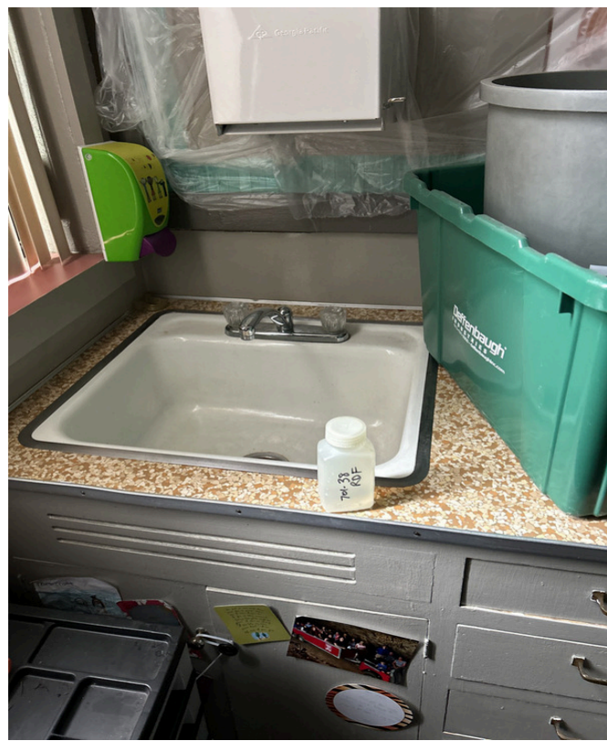
7/3/2024 - 701-38 - Ridgeview Elementary - 001427-Room 216