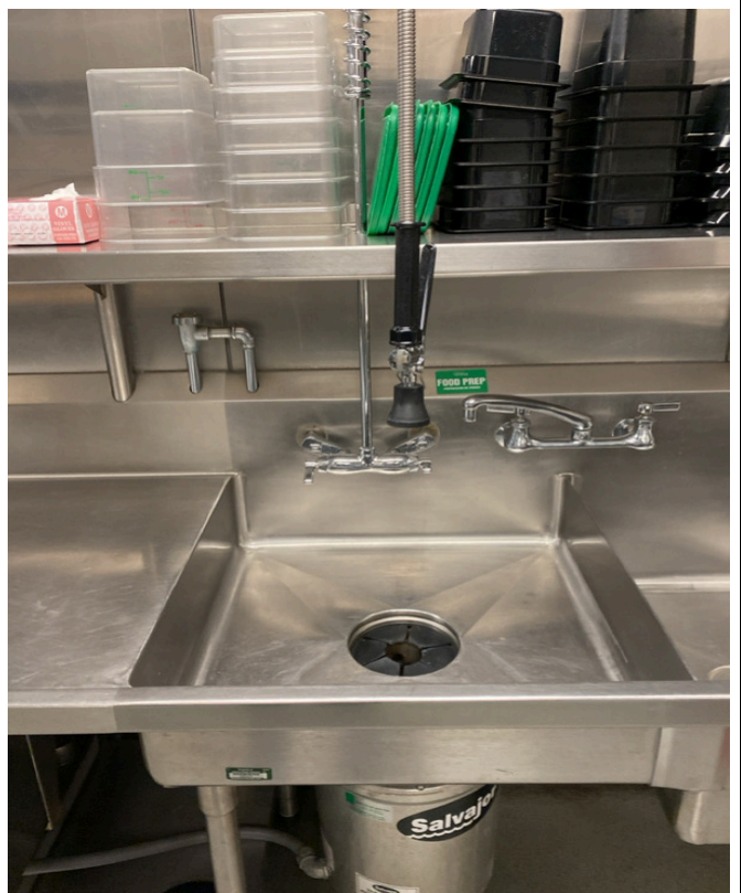
2/13/2025 - 701-122 - Ridgeview Elementary - 001743-Kitchen-Three Bay Sink