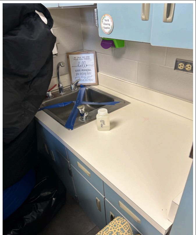
7/3/2024 - 1400-22 - Manor Hill - 001007F-Room 16