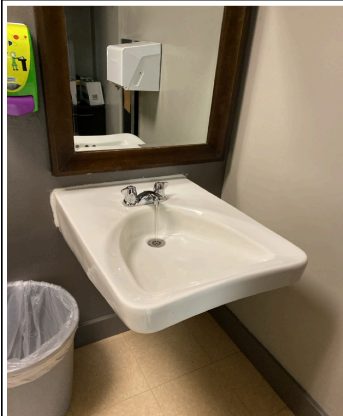
2/13/2025 - 1400-89 - Manor Hill - 001042-Outside Kitchen-Staff Restroom