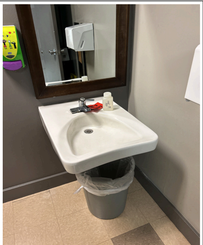
7/3/2024 - 1400-89 - Manor Hill - 001042-Outside Kitchen-Staff Restroom