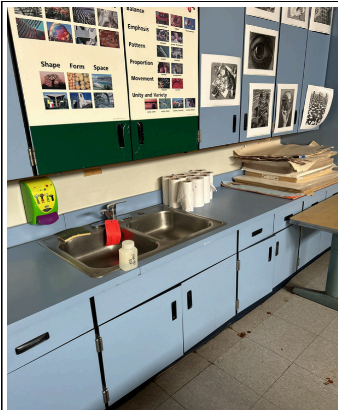
7/3/2024 - 1400-45 - Manor Hill - 001041-Room 31