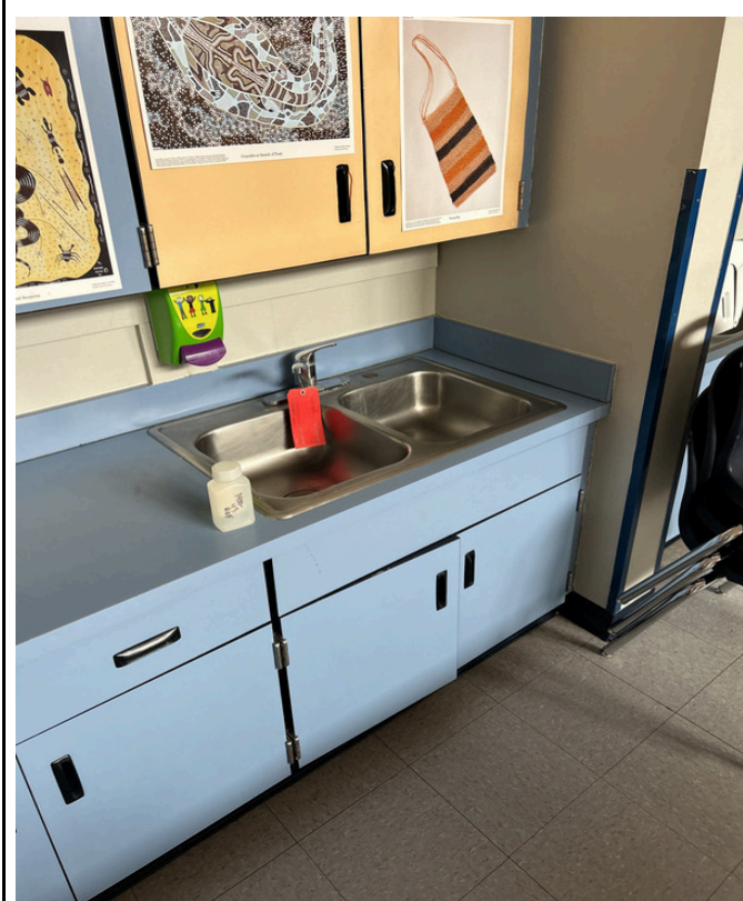
7/3/2024 - 1400-43 - Manor Hill - 00139-Room 31