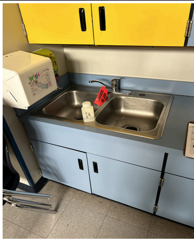
7/3/2024 - 1400-44 - Manor Hill - 001040-Room 31