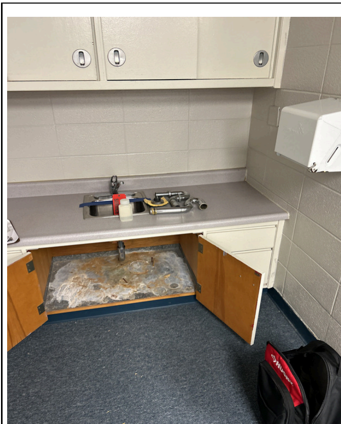
7/3/2024 - 1400-2 - Manor Hill - 001035-Room 9