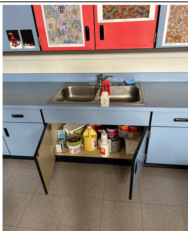
7/3/2024 - 1400-42 - Manor Hill - 001038-Room 31