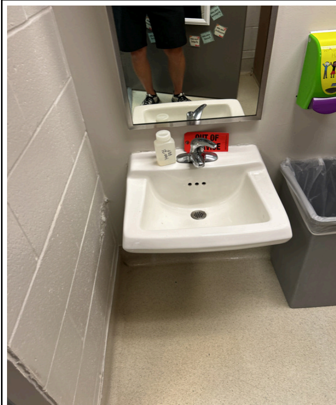
7/3/2024 - 1400-21 - Manor Hill - 001006-Room 14-Restroom