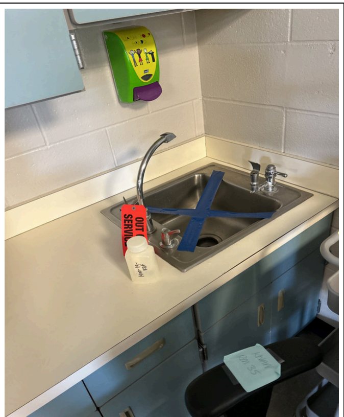
7/3/2024 - 1400-19 - Manor Hill - 001005F-Room 14