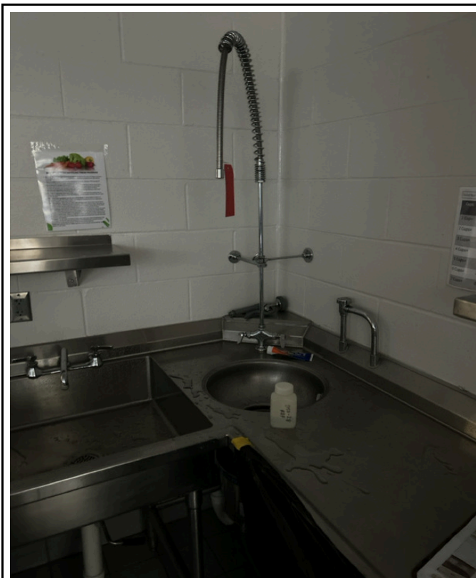
7/2/2024 - 8150-28 - Kitchen - 004629-Kitchen Dish Sprayer-By Office