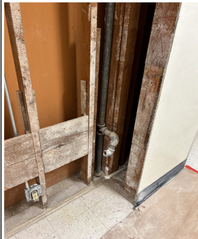
6/28/2024 - 201-34 - Franklin Elementary - 002567-Hall by Room 26 - Source Demolished