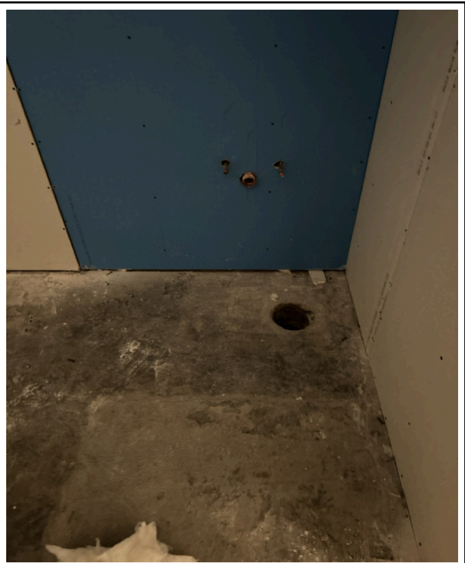
6/28/2024 - 201-22 - Franklin Elementary - 002568-Room 14 - Source Demolished