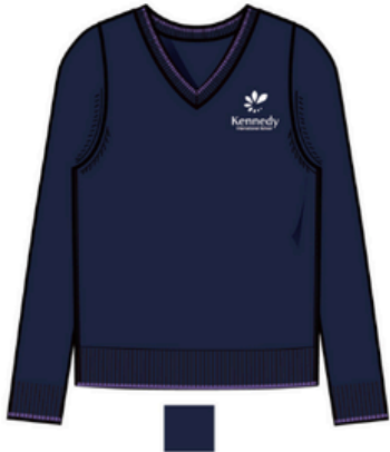
Unisex Long Sleeve V-Neck Sweater Content: 85% Cotton, 15% Spandex Price: 2T - 3T $33.00 including logo 4/5 - 18 $35.00 including logo