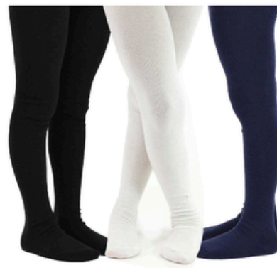
Navy blue or white tights (not offered by our vendor)

Note: Underskirts, tights, or leggings must be blue, black, or white, and plain with no logos or designs.