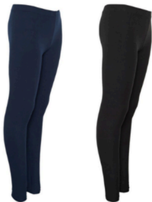
Black or navy blue leggings (not offered by our vendor)

Content: 66% Polyester, 27% Rayon, 7% Spandex Price: 2T - 3T $37.50 4/5 - 18 $39.50