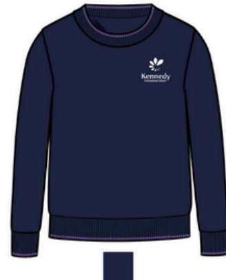
Unisex Long Sleeve Crew-Neck Sweater Content: 85% Cotton, 15% Spandex Price: 2T - 3T $33.00 including logo 4/5 - 18 $35.00 including logo