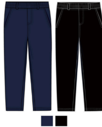
Unisex Pull On Pant Content: 97% Cotton, 3% Elastane Heavy weight fabric Price: 2T-4T $28.50