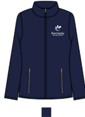
Full Zip Fleece Jacket

Price: 2T - 4T $40.50 including logo 4/5 - 12 $42.50 including logo