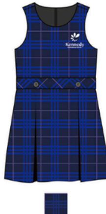
Plaid Pinafore Content: 66% Polyester, 27% Rayon, 7% Spandex Price: 2T - 4T $40.50 including logo 4/5 - 12 $42.50 including logo