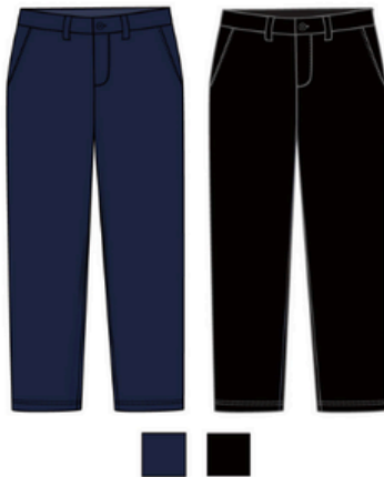
Unisex Straight Leg Pant Content: 85% Cotton, 15% Spandex Price: 2T - 3T $33.00 including logo 4/5 - 18 $35.00 including logo