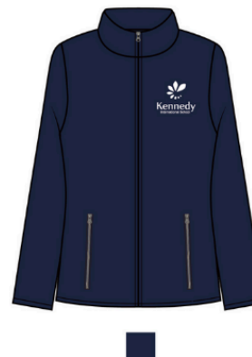
Full Zip Fleece Jacket

Price: 2T - 4T $40.50 including logo 4/5 - 12 $42.50 including logo