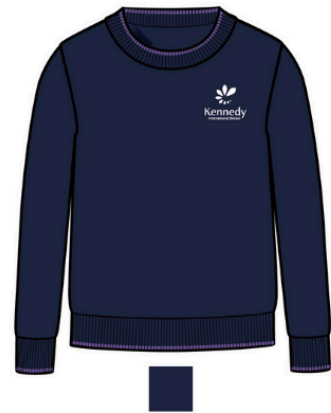
Unisex Long Sleeve Crew-Neck Sweater Content: 85% Cotton, 15% Spandex Price: 2T - 3T $33.00 including logo 4/5 - 18 $35.00 including logo