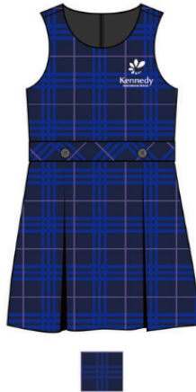
Plaid Pinafore Content: 66% Polyester, 27% Rayon, 7% Spandex Price: 2T - 4T $40.50 including logo 4/5 - 12 $42.50 including logo