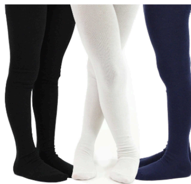
Navy blue or white tights (not offered by our vendor)

Note: Underskirts, tights, or leggings must be blue, black, or white, and plain with no logos or designs.