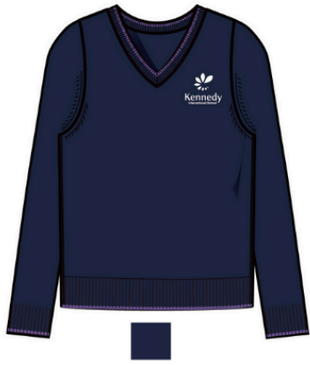
Unisex Long Sleeve V-Neck Sweater Content: 85% Cotton, 15% Spandex Price: 2T - 3T $33.00 including logo 4/5 - 18 $35.00 including logo