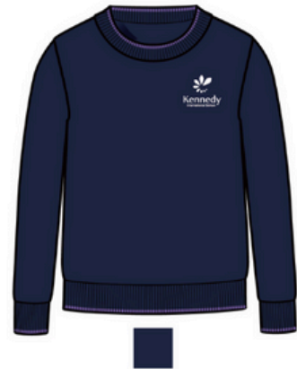
Unisex Long Sleeve Crew-Neck Sweater Content: 85% Cotton, 15% Spandex Price: 2T - 3T $33.00 including logo 4/5 - 18 $35.00 including logo