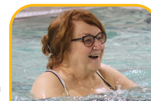
There are a variety of aquatics programs for adults at Crestview Middle School.

Fridays • Aug. 29-Dec. 12 • $150 8-8:45a • Shallow water Crestview Middle • Gold/Silver Card rates apply