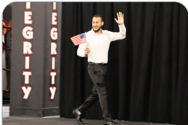
Learn more about the benefits of our free English as a Second Language classes at www.prcommunityed.org

Fall 2025 classes begin Tuesday, September 2. The school year will be divided into four sessions. New students will be added at the beginning of each session. Testing and/or orientation must be complete before beginning the session. Once our office reviews your application, a staff member will contact you regarding testing and/or orientation. For information about locations, class times and registration, visit prcommunityed.org or call/text 314-415-4940.