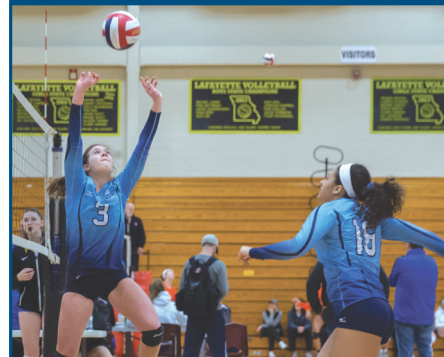
Rockwood Thunder is the premier volleyball club in the area. Learn more at rockwoodthundervbc.com .

You DO NOT have to live in Rockwood to participate in Rockwood Thunder programs or try out for teams.