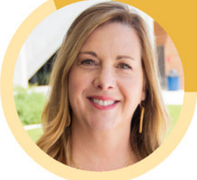
PRINCIPAL KINGSLAND KYRENE DEL CIELO

Get your backpack and school supplies packed the night before. On the first day of school, smile at your classmates and know that you will meet new friends!