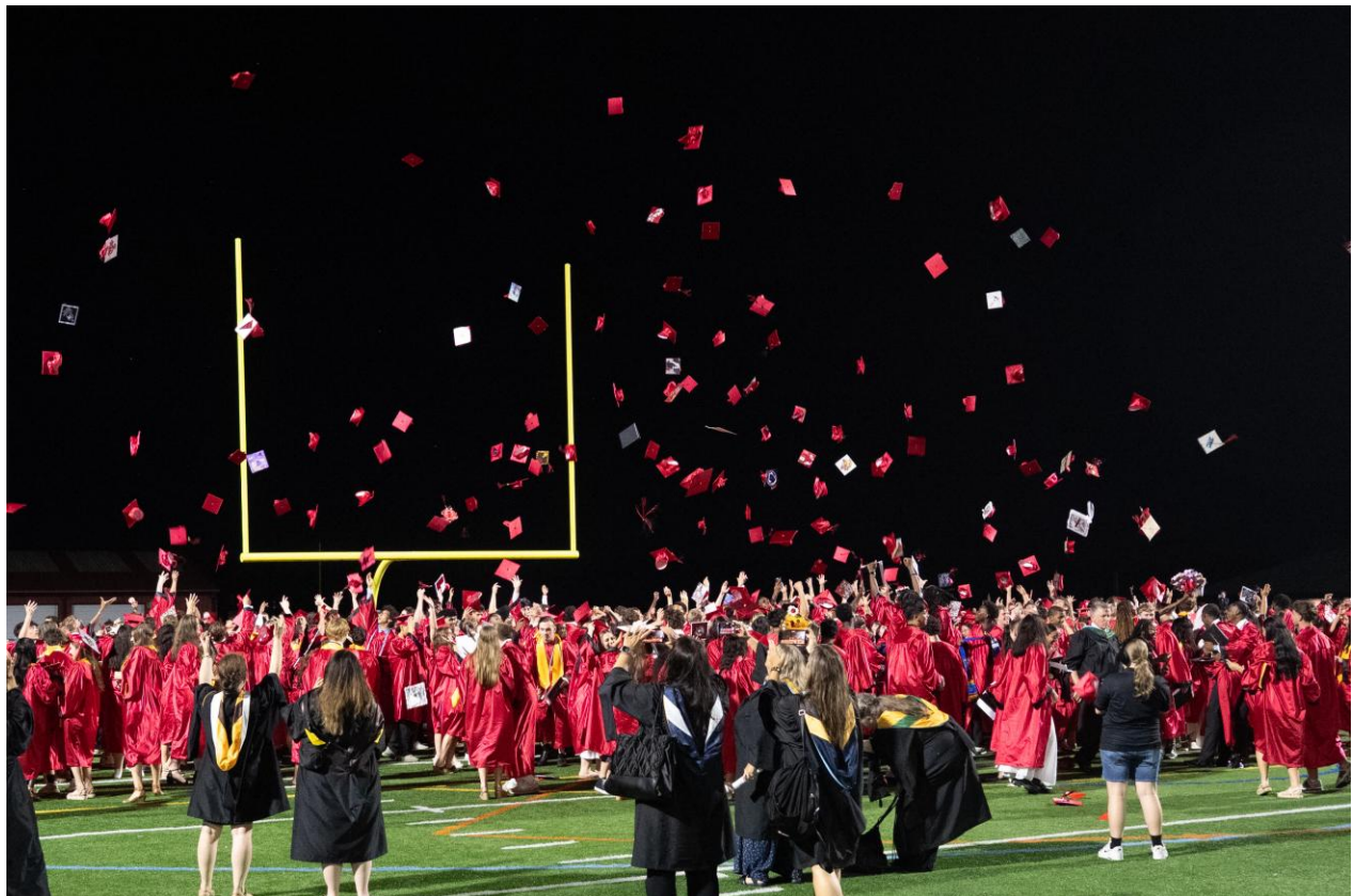
Home of the Dragons

On Wednesday, June 18th, Kingsway proudly graduated 511 students , marking the largest graduating class in school history . Due to rain, the ceremony was delayed to an 8:00 p.m. start , making the Class of 2025 the first to graduate under the stadium lights —a fitting tribute to a group that has continually broken barriers. This remarkable class earned more than 2,300 college credits before even receiving their diplomas, secured over $23 million in scholarships, grants, and awards , and will be attending some of the most prestigious colleges and universities in the nation . Surrounded by proud families, friends, and faculty, the Class of 2025 walked with confidence and pride, ready to leave their mark on the world. Be sure to check out the Senior Highlight Reel to relive the unforgettable moments from this historic night!