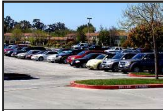
The student parking lot during class