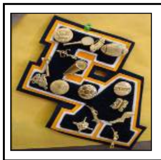
Above: EAHS Block Letter

Block letters can be requested for athletes who complete a season on a varsity team. A pin can also be requested to signify achievement in this area every year after the block is earned. If you have earned a block in athletics, please see the Athletic Director to request your block. Block letters can also be requested for some academic programs and achievements.