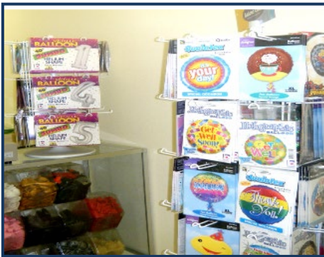
The EAHS Student Store has all of your school spirit wear, including PE Uniforms.

Our online store is now open with a variety of other items and can be accessed through our QR Code: