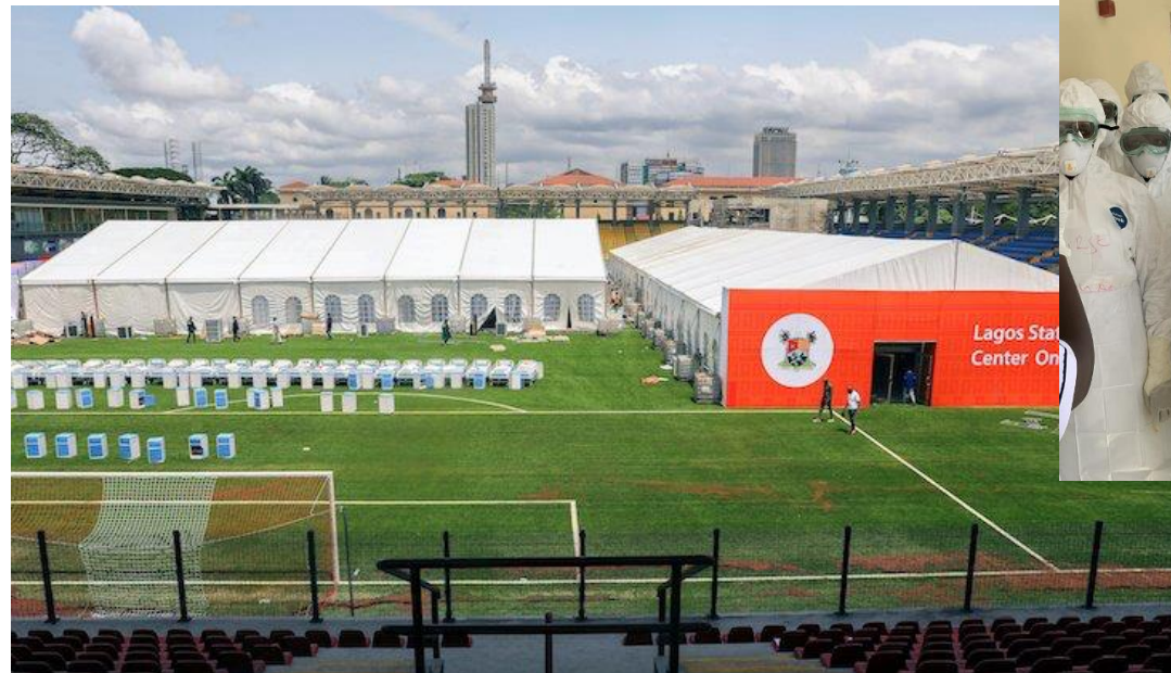
Mobolaji Johnson Arena, used as hospital in Nigeria