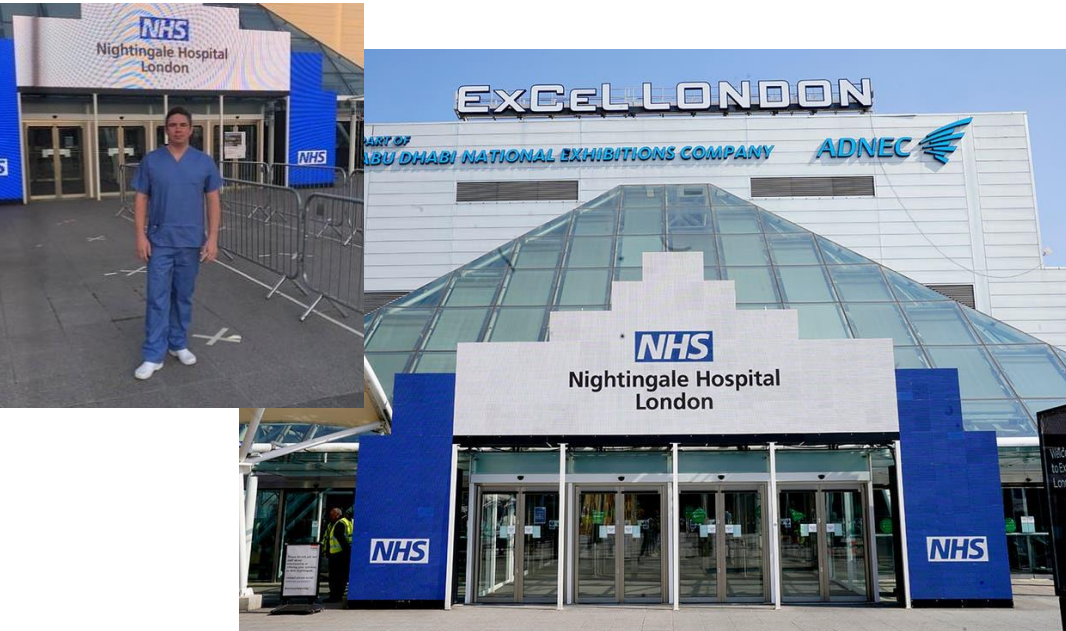
Excel, used as hospital in England