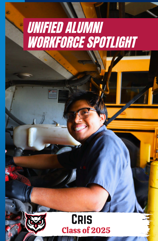
CRIS Class of 2025