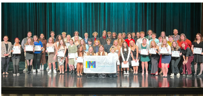
Tri-M Music Honor Society Re-activated at NTHS

Tri-M Music Honor Society returned to NTHS this fall with the induction of 48 new members on October 18th. In a festive ceremony held in the Fine Arts Center, new inductees were honored for their outstanding musical achievements, exemplary academic records and emerging leadership skills. In the months since, Tri-M students have been busy volunteering at various Fine Arts events including concerts, theatrical performances, and the All-County Festival held at NT in late January.