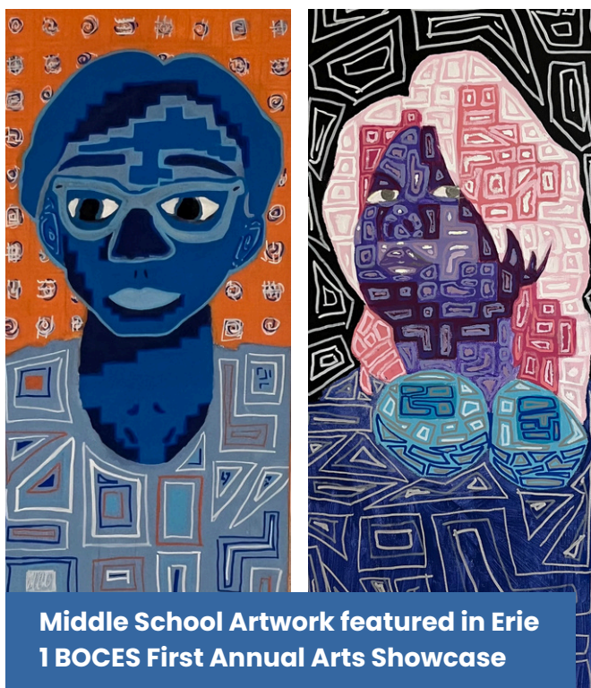
Middle School Artwork featured in Erie 1 BOCES First Annual Arts Showcase