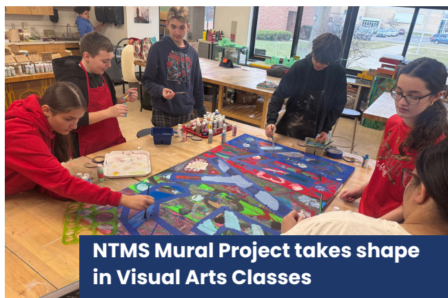
NTMS Mural Project takes shape in Visual Arts Classes