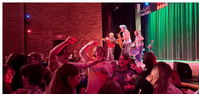
NTHS Jazz Students see Too Many Zoot at Springville Center for the Arts

Tri-M Music Honor Society returned to NTHS this fall with the induction of 48 new members on October 18th. In a festive ceremony held in the Fine Arts Center, new inductees were honored for their outstanding musical achievements, exemplary academic records and emerging leadership skills. In the months since, Tri-M students have been busy volunteering at various Fine Arts events including concerts, theatrical performances, and the All-County Festival held at NT in late January.