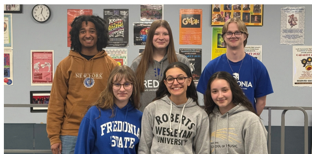
Six NTHS Seniors Headed for College Music Majors