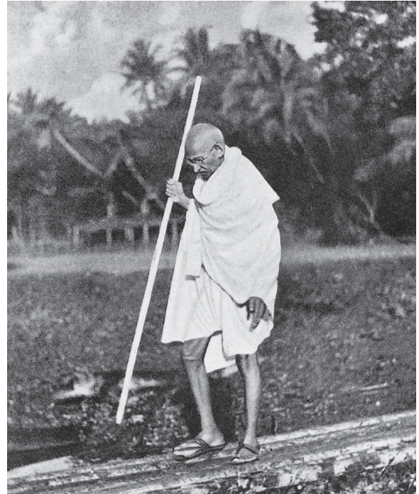
Mohandas Gandhi, referred to as the Mahatma or “Great Soul” by many, rejected Western dress in favor of Khadi or homespun as a symbol of Indian independence from Britain.

In 1930, Gandhi again led a swadeshi campaign. Gandhi chose to protest the salt tax because of its impact on all Indians. Salt was a British monopoly—since 1804 Indians had been prohibited from making their own. In a symbolic act of defiance, Gandhi and a group of followers walked 240 miles from Ahmadabad to Dandi on the Gujarat coast, where he lifted a handful of salt from the sea. Others marched throughout the country; in many