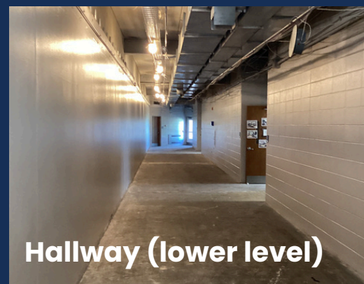
Hallway (lower level)

In addition to the ongoing interior renovations, the roof at Centennial School will undergo repairs and receive a full protective coating designed to extend its life by an estimated 25 years.