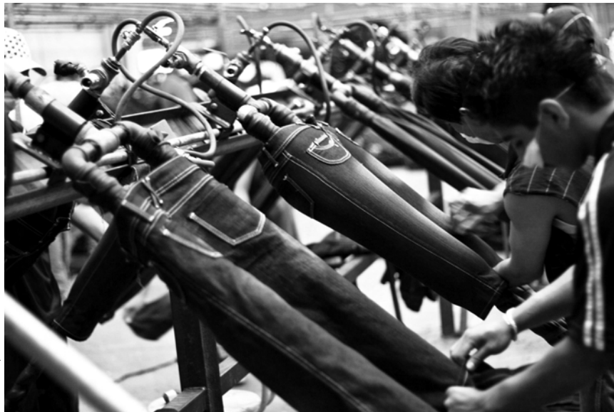
Workers at a jeans factory in the state of Guanajuato, Mexico apply "wear" and other styling to the pants. This factory used to produce the bulk of its jeans for export but due to competition from companies in countries like Bangladesh and India, the factory has not been able to get as many foreign contracts. When this picture was taken, the factory was operating at about 40 percent capacity, and factory owners were concentrating more on selling to the local market in Mexico.

The global financial crisis in 2008 has put the brakes on growth in this sector. Foreign companies are tentative about investing in new factories and the number of people buying cars has drastically reduced. Nevertheless, many analysts believe that