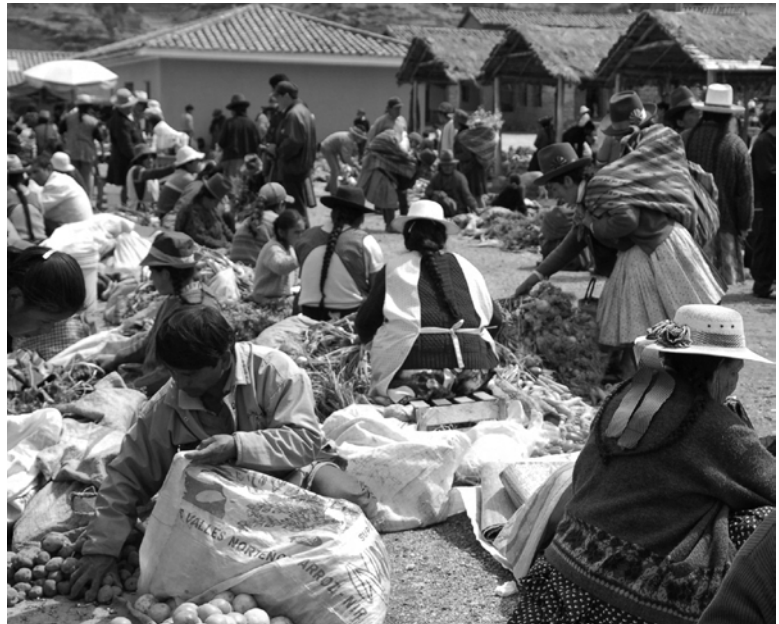
Vendors at a market in Chinchero, Peru. In many countries, people can buy much of what they need from street traders as well as from stores. Today, in cities around the world, one can buy shoes made in China, clothes made in India, produce grown in Latin America, or electronics from Taiwan from vendors on the street.

Supporters of free trade argue that everyone has the potential to be better off as more and more countries join the global marketplace. For example, standards promoted by rich countries have helped improve worker conditions in many countries. Supporters argue that in many parts of the world, free trade has helped decrease poverty and inequality.