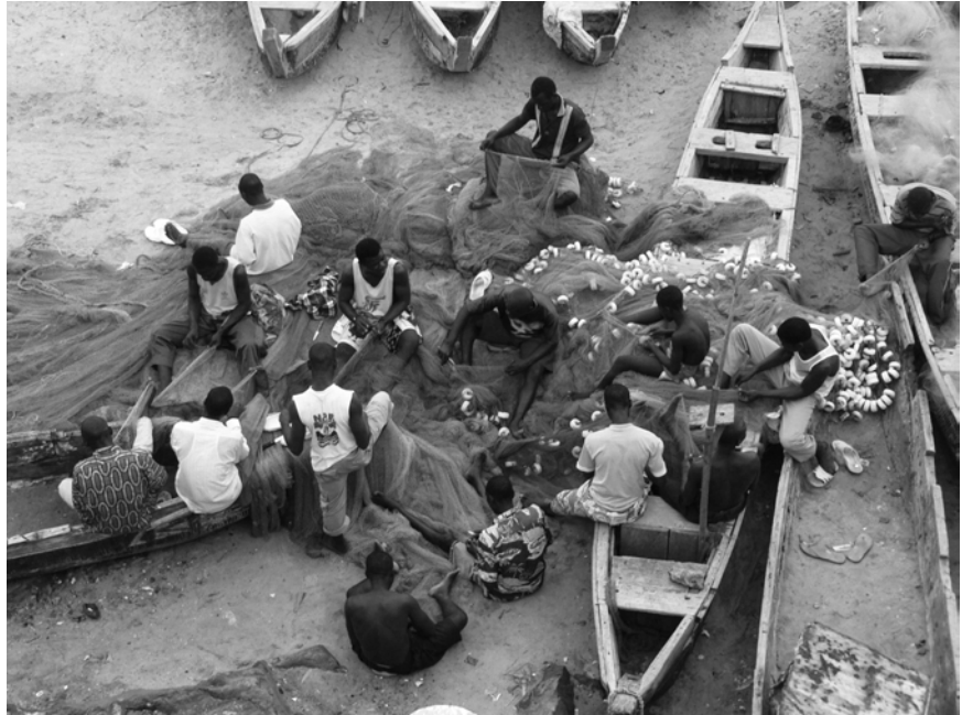
Fishers in Ghana repair their nets. While most of the fish that are caught are consumed by the local population, in recent years, increasing amounts of certain fish like tuna are being refrigerated or canned and exported to foreign markets. Like the fishers in Senegal, Ghanaian fishers have struggled as overfishing, both by local and foreign fishers, has greatly depleted local fish populations.

Senegal's food sector provides a good example of the effects of increased international trade on local economies. Globalization's mixed effects are well illustrated in the recent changes to a popular Senegalese dish made from rice, tomato, fish, and onion. In the past,