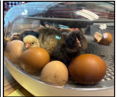
Our 4 th graders enjoyed hatching chicken eggs