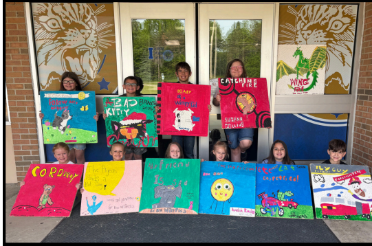
Boyce Book Drawing Ceiling Tile Winners