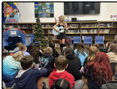
March Is Reading Month Visitors