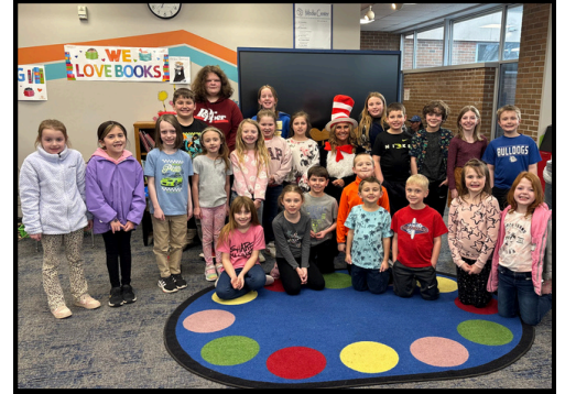
Staff and students having fun at AR night