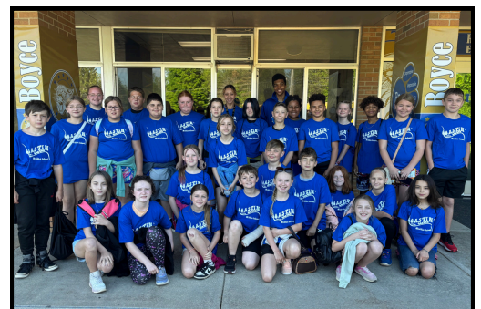
Congratulations to our 5 th Grade Graduates