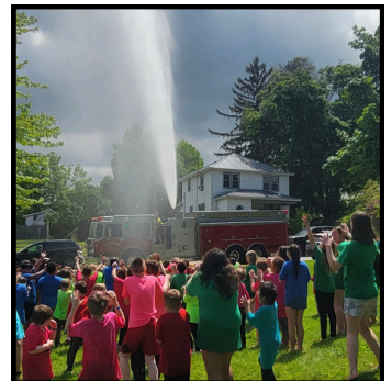
Students enjoyed spirit days, field trips to museums, a state park, Michigan Adventure, and field day fun!

S afety O wnership A chievement R espect