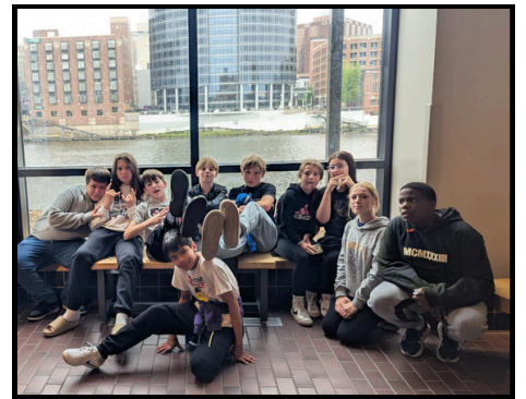
7th Grade Field Trip to the Grand Rapids Public Museum