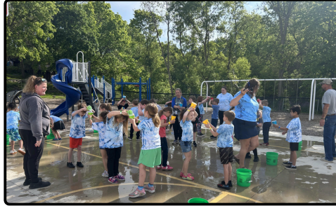
Field Day Fun!