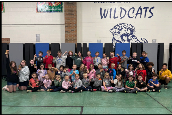
Boyce Scenic Run Winners