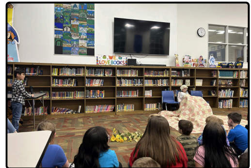
1st Grade Performance "Little Red Riding Hood"