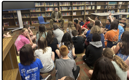
Arbor Day Tree Celebration with Mayor Milewski & 5th Grade Students