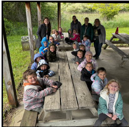
Outdoor Adventure Day Activities