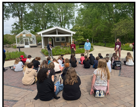
6th Grade Field Trip to Calvin University