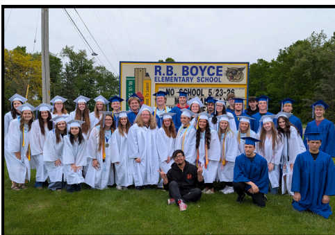
Boyce Alumni Senior Good Bye