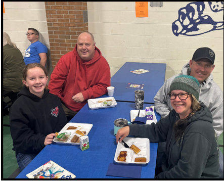
Families enjoyed our Breakfast Buddies

Through our commitment to strong academic programs, engaging activities, and a positive school climate, Boyce Elementary is fostering a love for learning that extends beyond the classroom. We believe that every day is an opportunity to create lasting memories. We hope you have an enjoyable summer!