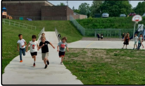
Walk for a Cause - IM3rd Meal

What an incredible year it has been at Jefferson Elementary! We've truly enjoyed learning, creating, and making lasting memories together. A heartfelt thank you to our amazing students, dedicated staff, and supportive families - none of this would have been possible without you. We hope you have a fantastic summer filled with rest and fun! We can't wait to welcome you back soon.