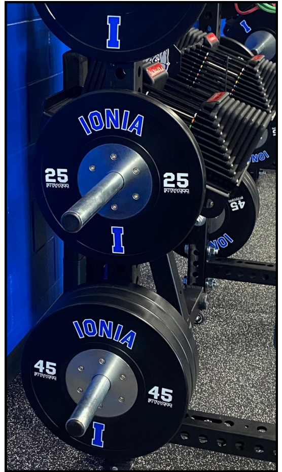
Before and after photos of the updated IHS Weight Room