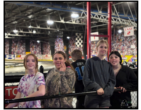
8th Grade Field Trip to Craig's Cruisers