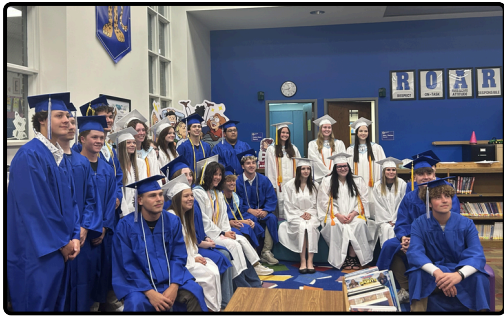
Jefferson Alumni - Senior Walkthrough