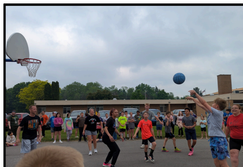
5 th Graders vs Staff Basketball Game