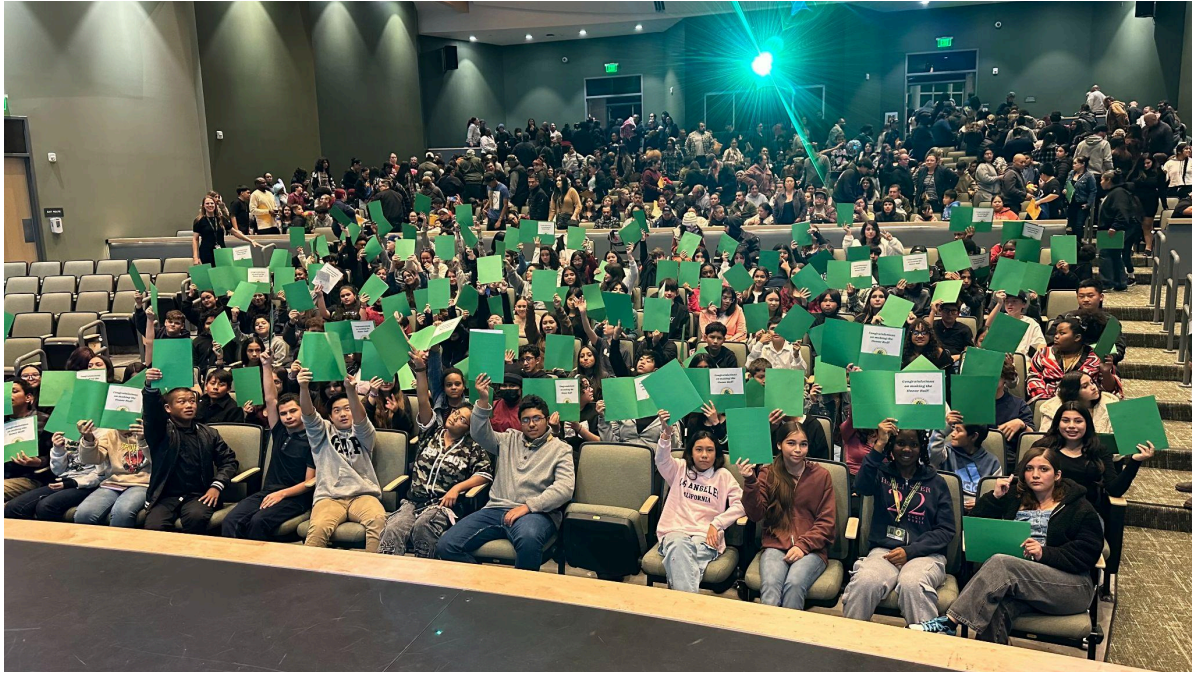
PHOTO CAPTION: Excitement fills the air as Nicolet Middle School Honor Roll scholars exit the Banning High School Performing Arts Center after being recognized for their academic achievements.

Developing Responsible, Respectful and Prepared Students