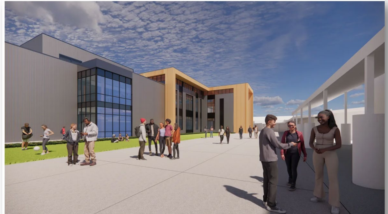
Phase 1 addition rendering (draft as of January 2024)