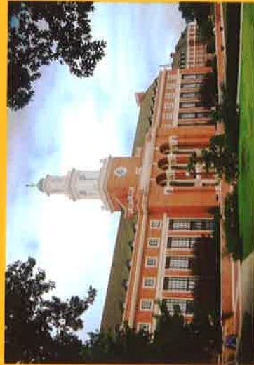
Oklahoma State University

"You can't go back and change the beginning, but you can start where you are and change the ending." C.S. Lewis