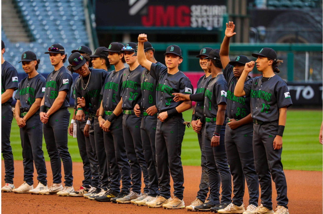
PHOTO CAPTION: Banning High School baseball players stand with pride at the Angels Stadium in Anaheim.