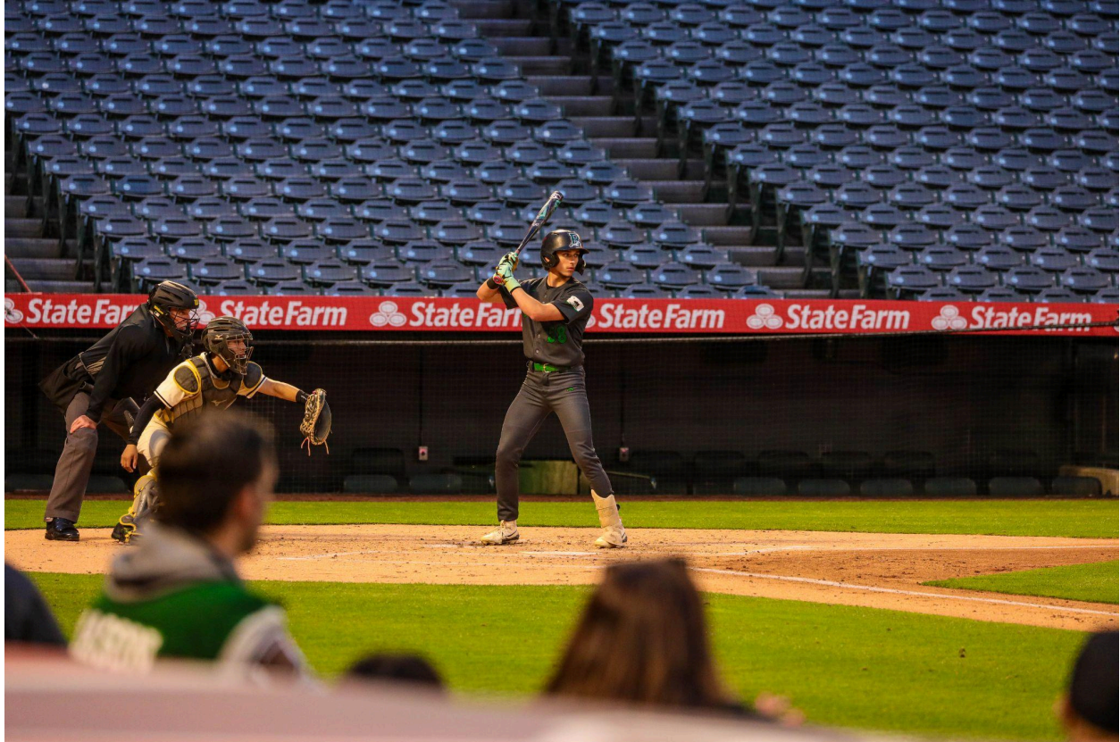
PHOTO CAPTION: Banning High School baseball player gets ready to swing at a pitch from Arroyo Valley High School pitcher.