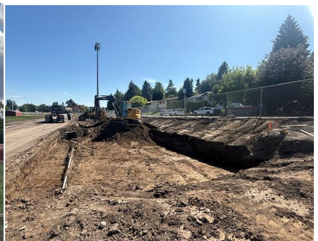
Visitor's Side Bleacher Pad