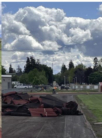
Track Surfacing Demo