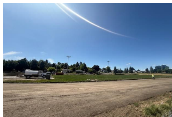
Track Surfacing and Lane 1 Demo