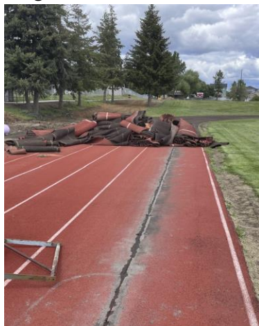
Track Surfacing Demo